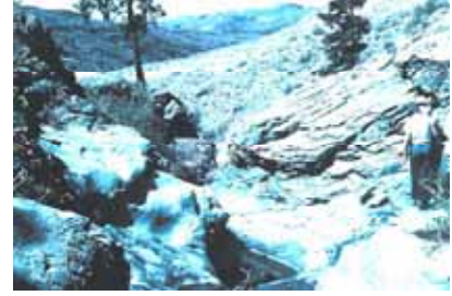
Figure 1. Blue Schist of Tunk Creek