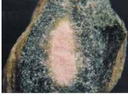
Figure 3. Thulite Specimen

There was plenty of light pink thulite, but I wanted some of the bright pink material that has made the area famous. As we worked our way back up the stream, I climbed up on a ledge and spotted a small bit of pink. When I broke open the rock, I found the beautiful specimen shown in Figure 3. I also found some very good material with a mixture of pink and green. I broke off several pieces and felt I had made a good haul. However, after I got home and turned over one of the green chunks, I discovered a large red ruby on the back side. Unfortunately, I had managed to hit the ruby dead center with my rock hammer and it was shattered. At any rate, I had found a ruby, which must be rare. I have heard of blue corundum (sapphire) being found but not red corundum (ruby).