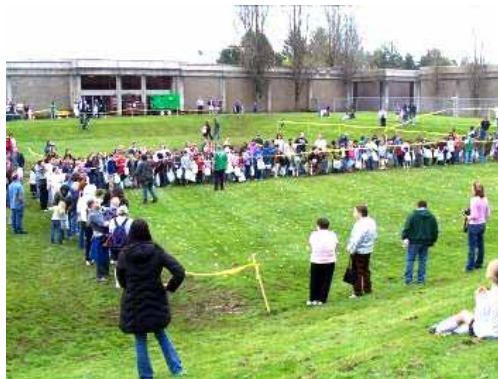
Mt. Hood Thunderegg Hunt

Early April brings out one of the most festive events when the Mt Hood Rock Club presents their Annual Show in Gresham, Oregon. The famous attraction of this Show is the big Easter (Thunder) Egg Hunt for KIDS where 800 pounds of T eggs are "hidden" for about 600 KIDS to discover in a matter of minutes. What a dependable way to mobilize KIDS and their parents to get to your Rock Show so they can experience the goings-on of our favorite hobby--Rockhounding!