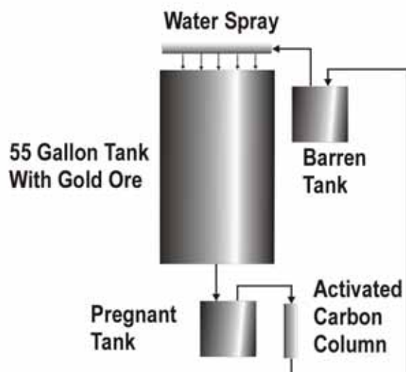
Figure 1. Extracting Gold with Cyanide Leach

Everything went as planned except for two things. I had a hard time extracting the gold from the carbon. I could burn the carbon and then use an assay process to extract the gold and silver from the ash, but that was too slow and the expensive carbon was lost. I never could get the alcohol to work. I tried replacing the carbon columns with a zinc shavings tray. That worked well but the water rapidly became saturated with zinc ions. In the end, all of these problems didn't matter because there was a much bigger problem. The cyanide dissolved the copper as well as the gold. There was copper everywhere. The carbon columns soon jammed, the two holding tanks had a blue copper crust around the edges and on the bottoms, and I found a half-inch of blue copper mineral in the bottom of the ore drum. This was a handy way to extract copper, but since the cyanide cost about as much as the copper was worth, the approach was not viable. However, I did learn a lot and I was successful in plating small amounts of both gold and silver directly out of the cyanide solution.