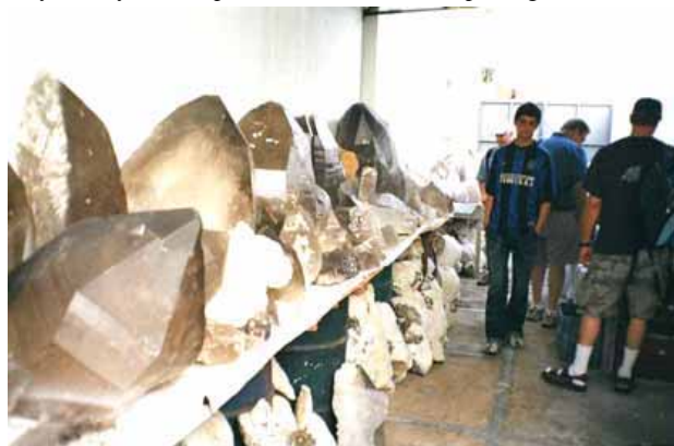
merchants who frequent the Annual Tucson show.