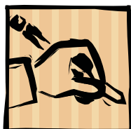
DARLENE'S DOODLES NFMS Bulletin Aids