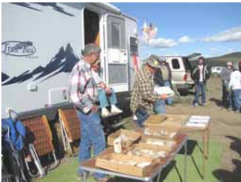
A Rock Swap