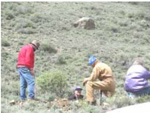
Digging for Opals