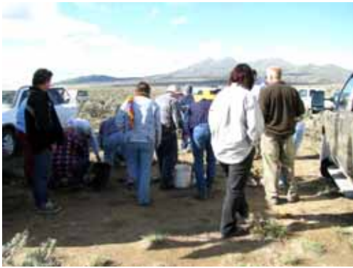
Heading Out for the Big Dig