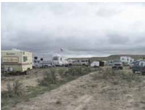
And It Was COLD Too!