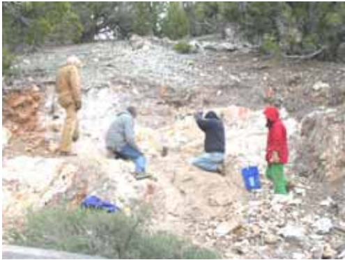
Digging for Onyx