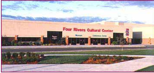
Four Rivers Cultural Center, Ontario OR

68 th Annual NFMS Show & Convention June 20-22, 2008