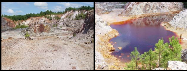
(Continued from page 8)