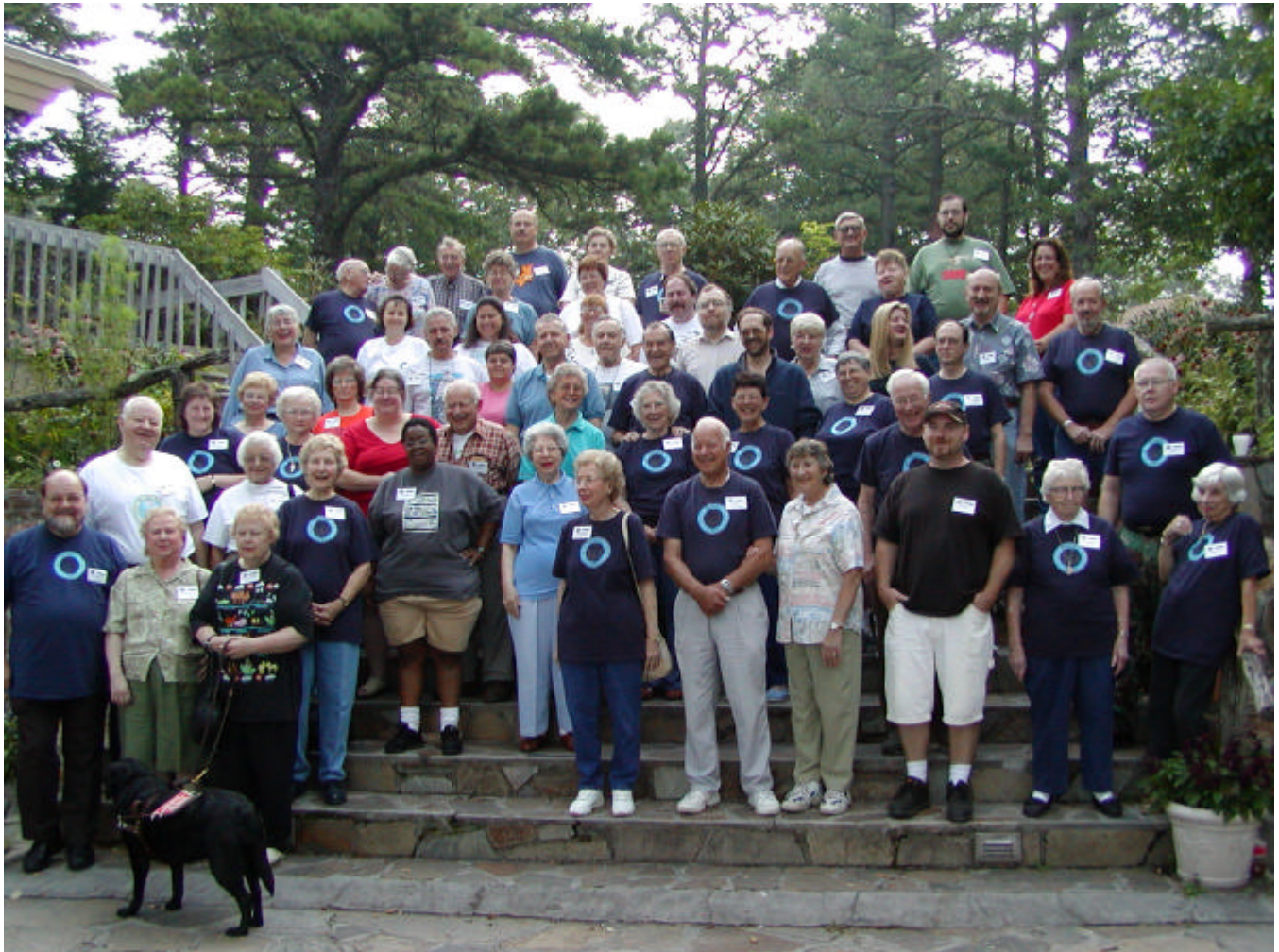
Hail, Hail, The Gang's All Here - Group picture taken Thursday, Sept 6 th