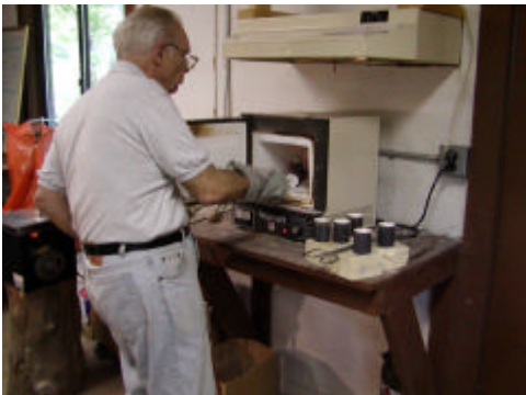
The kiln comes into play to melt the wax from the investment.