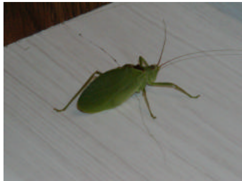
Clyf and Bruce posed this fellow - -