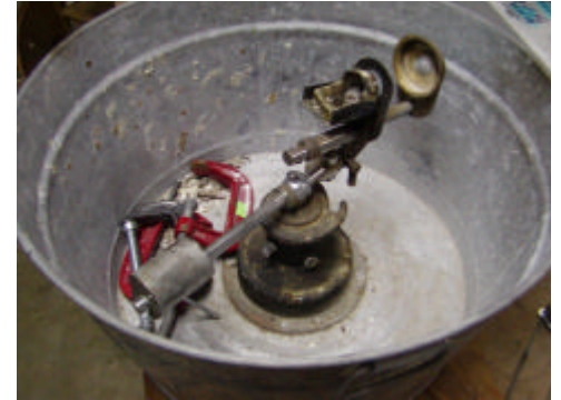
A close-up of the centrifuge.