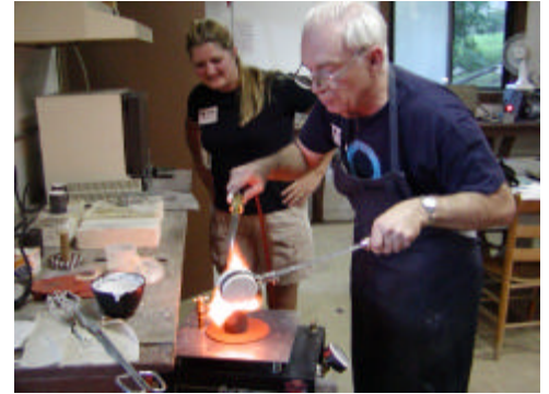
Concentration is the key. Things get pretty hot around here.