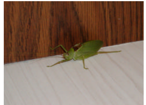
By this time he was missing one leg.