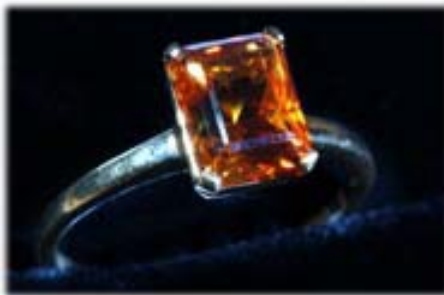
Citrine Ring 14K Gold (Ladies)