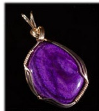
Sugilite Cab (30x40) Wire-wrapped - 14K Gold