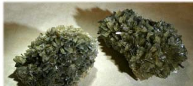
Barite Specimen (2 Winners)

to me at 2430 N. Glebe Road, Arlington, VA 22207-3536. My telephone number is (703) 522-7415. Tickets will also be made available for your convenience during the Wildacres "summer" session and the AFMS/EFMLS Annual Convention in Syracuse, NY.