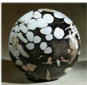
4 Inch Peanut Wood Sphere from Australia