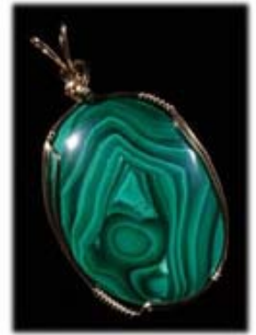
Malachite Cab (30x40) Wire-wrapped - 14K Gold

As always, your generous support in purchasing the tickets is greatly appreciated.