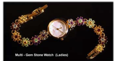
Multi - Gem Stone Watch (Ladies)

SEE THEM IN COLOR AT < WWW.AMFED.ORG/EFMLS >